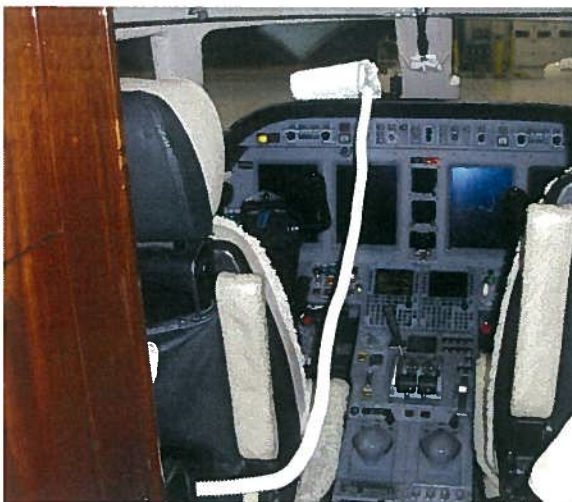
Wrapped IVU on Glare Shield for Left pilot Inboard deployment