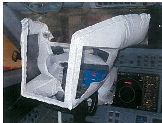
View of instruments through inflated IVU