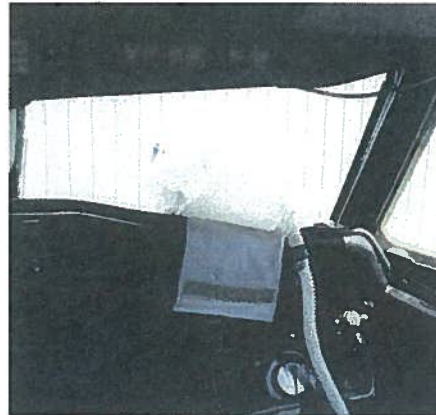
IVU on Glare Shield with wrapper open