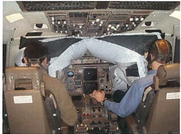
Both pilot IVUs inflated