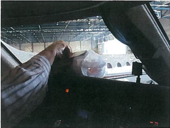
Releasing the IVU wrapper

Do not open the wrapper to inflate the IVU unless the IVU is in place on the glare shield.