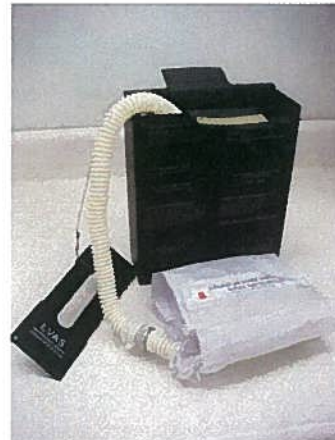
EVAS™ container with cover open & IVU out

While in use, EVAS™ will inflate the IVU with filtered, clear air at a pressure slightly above that of ambient air, thus completely displacing all smoke from the volume of the IVU. As the IVU is transparent, this gives the pilot a clear vision path to the essential flight instruments and forward along the flight path. A separately powered small light is provided to illuminate the instruments and checklists, if needed.