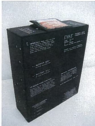
EVAS™ container, closed with IVU inside

EVAS™ is an acronym for “Emergency Vision Assurance System.” EVAS™ is a self-contained system that includes a battery powered blower which draws smoky air in through a filter, filtering out the visible particles, and out to a flexible air duct, which is connected to an inflatable transparent envelope, called the “Inflatable Vision Unit” (IVU). The entire EVAS™ system is contained in an aluminum container that is approximately the size of a Jeppesen manual, and weighs approximately 6 pounds.